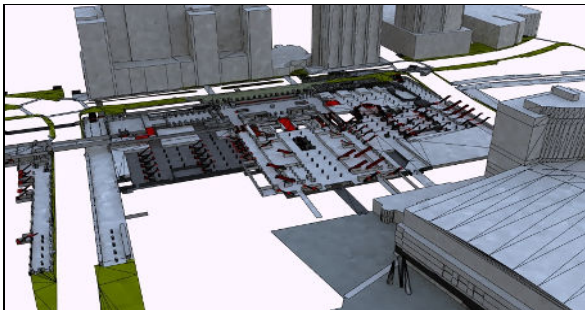
Figure 4 - Simulation Environment (2021)

The intent of the Phase 2 study was to provide greater insight into the existing and future operation of Union Station from a pedestrian flow perspective and to refine concepts for the layout of retail, commercial and transit-related components within Union Station. This work was coordinated with other transportation planning elements (e.g. loading, servicing, taxi stands) and other initiatives in the immediate area. The work undertaken by Arup in Phase 2 was intended to answer four fundamental questions: