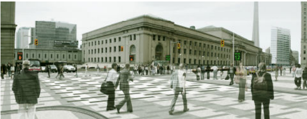
Figure 2 - Proposed Configuration of Bay St. & York St. Intersection

Toronto City Council adopted the Union Station District Plan in May 2006. The District plan provides an opportunity to advance pedestrian issues in the vicinity of Union Station. The Plan makes several recommendations and pushes the pedestrian agenda in ways that are positive and proactive – and new - for the City of Toronto.