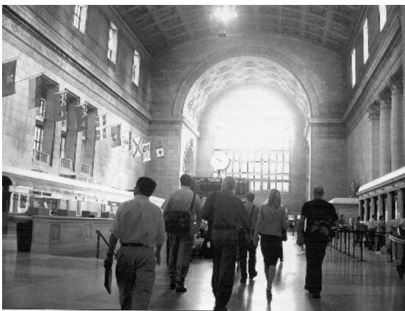
Figure 6 - Great Hall, Union Station

The pedestrian planning initiatives undertaken at Union Station to-date have been very successful. The process of policy development and confirmation involved a wide range of interest from the station operators, decision makers and the public. The importance of pedestrian activities at Union Station and its environs and the need to plan for and accommodate growth are clearly articulated in City policy and programs.