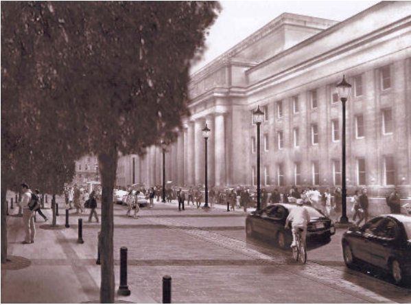
Figure 1 - Proposed Front St. Configuration

Toronto City Council adopted the Union Station Master Plan in December 2004. The Master Plan is a bold, visionary roadmap for the restoration, revitalization and operation of the Union Station complex. As a high-level policy document it is intended to direct decision making for Union Station as it continues to evolve.