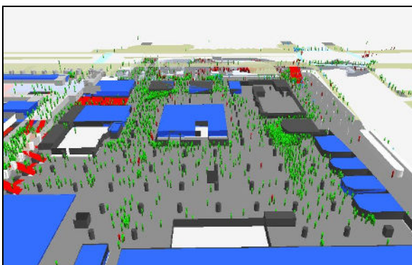
Figure 5 - Predicted pedestrian volume in Bay St. Concourse (2021)